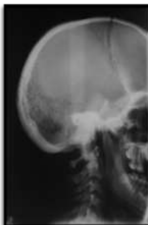
Fig No 9: