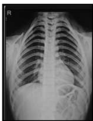
Fig No 11: