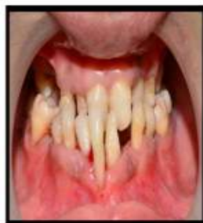
Fig No 4a: