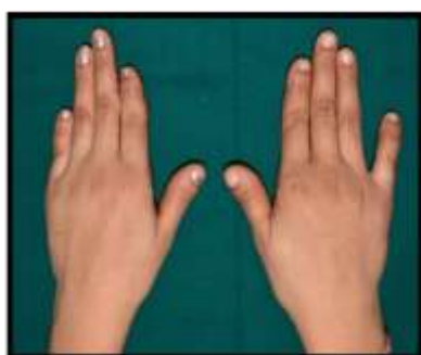
Fig No 5: