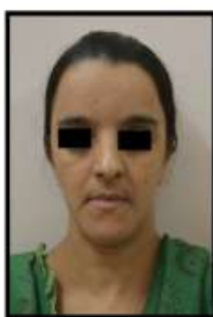
Fig No 2: