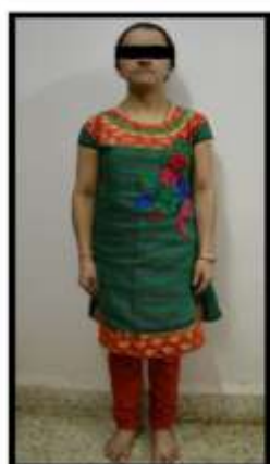
Fig No 1: