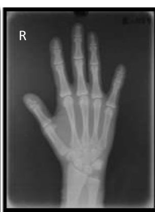
Fig No 12a: