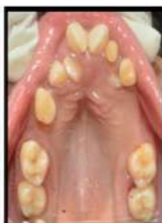
Fig No 4b: