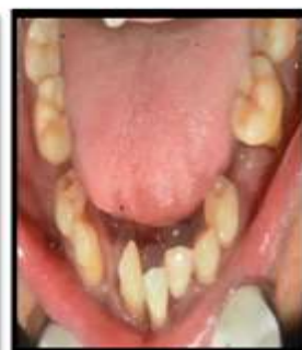
Fig No 4c: