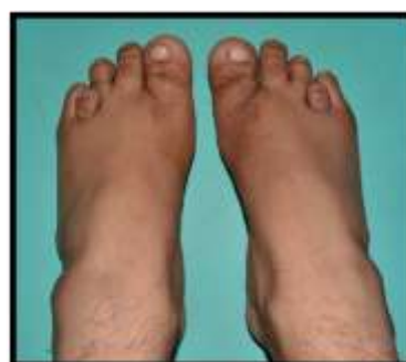
Fig No 6: