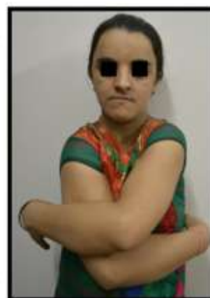
Fig No 3: