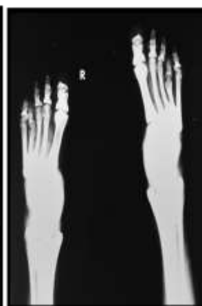
Fig No 10: