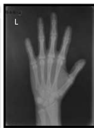
Fig No 12b:

Figure 7:- Orthopantomogram shows multiple impacted permanent and supernumerary teeth in the incisor and bicuspid regions of the maxilla and mandible with over-retained deciduous teeth. Parallel sided ascending ramus seen bilaterally with upward pointing of the coronoid process.